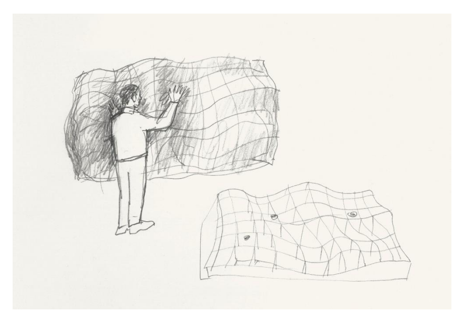
Words Just for You (drawing for installation), 2017 Wooden structure, felt, approx. 120 \times 160 \times 50 cm

Ahn's new works on exhibit in Words Just for You can be seen as an extension of his early practice that focused on "object sculpture." However, this new body of work is more inspired by primary forms including circles, spheres, straight lines, and spiral structures. If Ahn's recent solo exhibition at the National Museum of Modern and Contemporary Art, Seoul, Invisible Land of Love , was organized around a literary narrative, this exhibition focuses on the condition and physicality specific to an object.