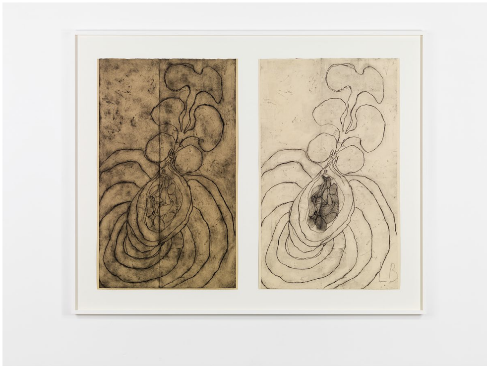
Louise Bourgeois (1911-2010) TURNING INWARDS SET #4 (SWELLING) 2007 Etching on paper, diptych Left: 152.1 x 92.7 cm, Right: 152.4 x 93.1 cm