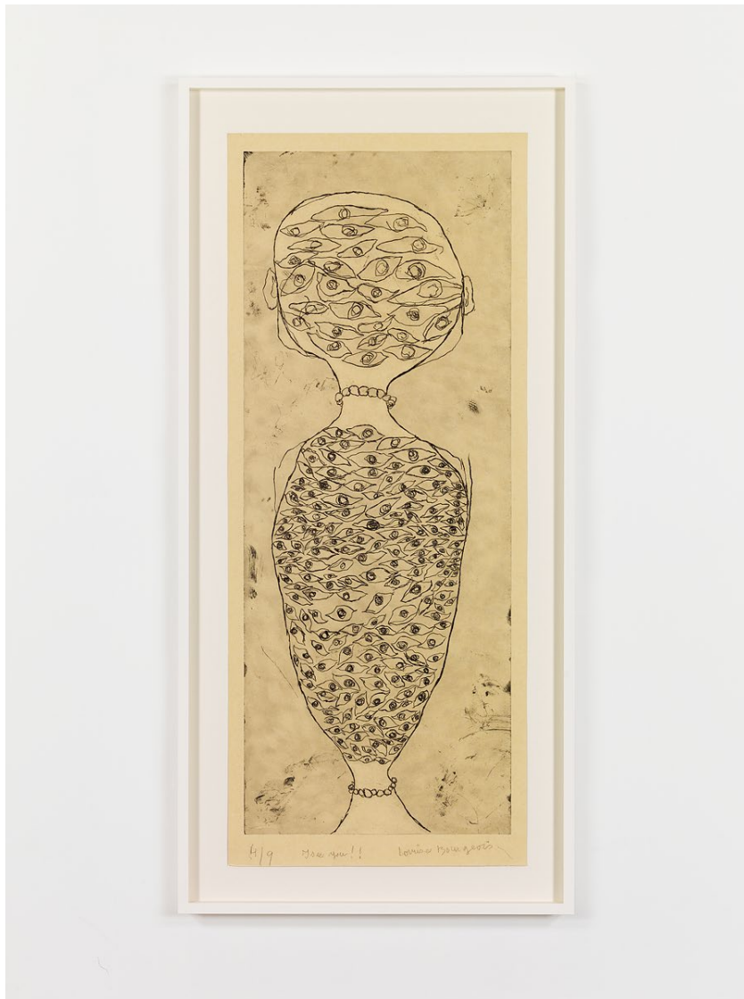
Louise Bourgeois (1911-2010) TURNING INWARDS SET #4 (I SEE YOU!!!) 2007 Etching on paper 151.1 x 61.9 cm