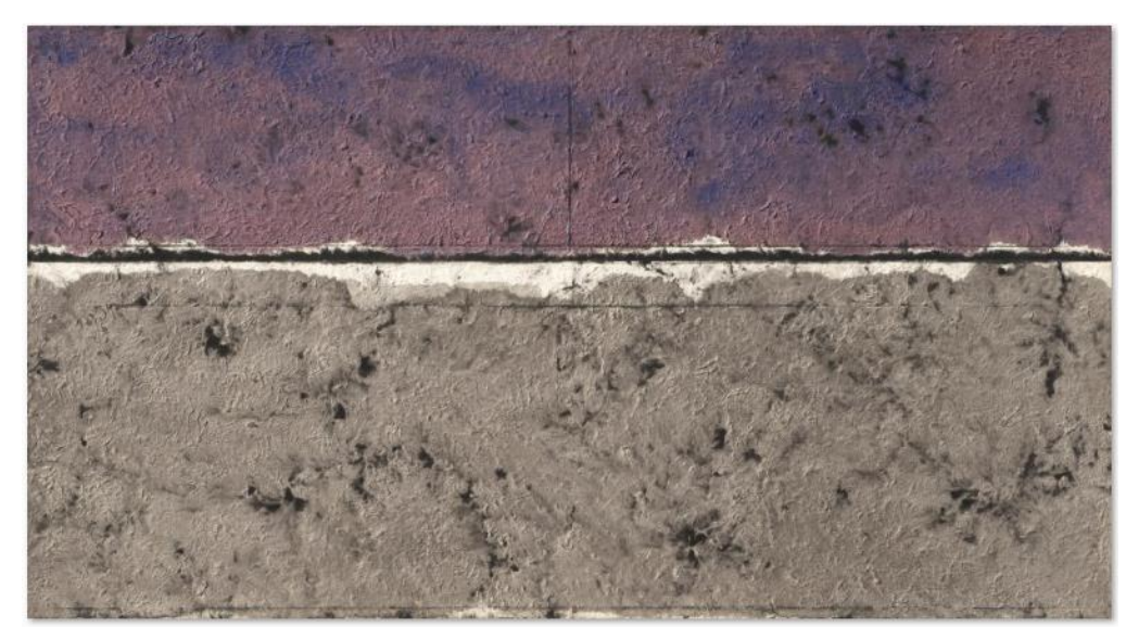
Meditation 91108, 1991, Tak (best fiber) on canvas, 110 x 200 cm

Exhibition Date: February 26 – March 27, 2016 Exhibition Venue: Kukje Gallery K1 & K2 Press Conference: Friday, February 26, 2016, 2 PM