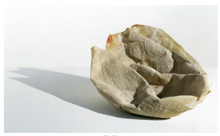
No title 1969 Cheesecloth, adhesive 43.7 x 28.5 x 11.5 cm / 17 1/4 x 11 1/4 x 4 1/2 inches © The Estate of Eva Hesse.