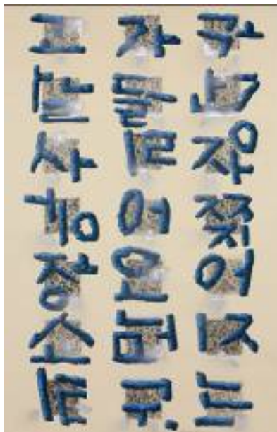
Untitled 1994-1995 acrylic on canvas 299 x 147 cm