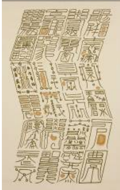
Untitled 1994-1995 acrylic on canvas 229 x 147 cm

Use of images must clearly credit the artist and other relevant parties.