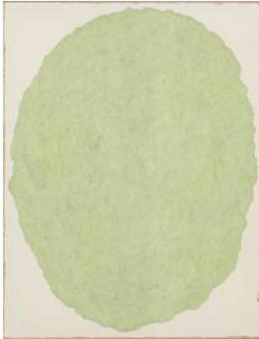
Untitled 2009 Acrylic on canvas 112 x 145.5 cm