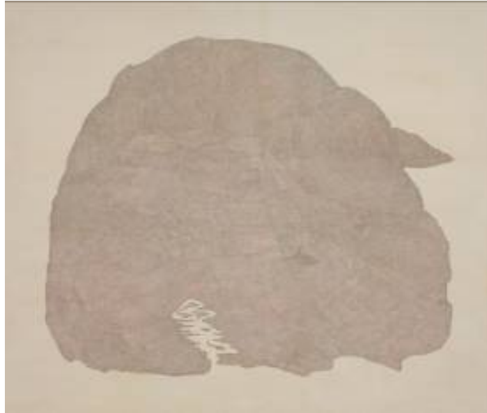
Untitled 2007 acrylic on canvas 201 x 236 cm

Use of images must clearly credit the artist and other relevant parties.