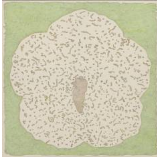
Untitled 2009 acrylic on canvas 96.5 x 96.5cm

Use of images must clearly credit the artist and other relevant parties.