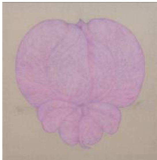
Untitled 2009 acrylic on canvas 146 x 143 cm