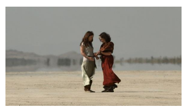
The Encounter, 2012

Two women are taking separate journeys at opposite ends of their lives. At the intersection of their meeting, during a brief encounter, life bonds are strengthened and the mystery containing the knowledge is quietly passed on from the elder to the younger.