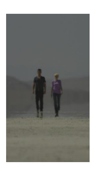
Delicate Thread, 2012

Two women are taking separate journeys at opposite ends of their lives. At the intersection of their meeting, during a brief encounter, life bonds are strengthened and the mystery containing the knowledge is quietly passed on from the elder to the younger.