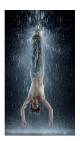
Water Martyr, 2014

K2 1<sup>st</sup> Floor 3<sup>rd</sup> Room