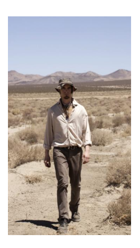
Inner Passage, 2013

Inner Passage chronicles a brief moment in one man's solitary journey into the Mojave Desert of Southern California. In this landscape, the physical body confronts extremes of endurance in the form of scorching heat, numbing cold, blinding light, impenetrable darkness, infinite distance and forced confinement. It is also where the metaphysical extremes of loneliness, isolation, stress, anxiety and fear meet the forces of overwhelming beauty, mystery, wonder and ecstasy. The present moment lies between these two states with all its uncertainty and promise.