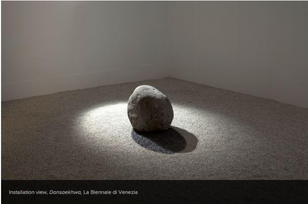
Installation view, Dansaekhwa , La Biennale di Venezia