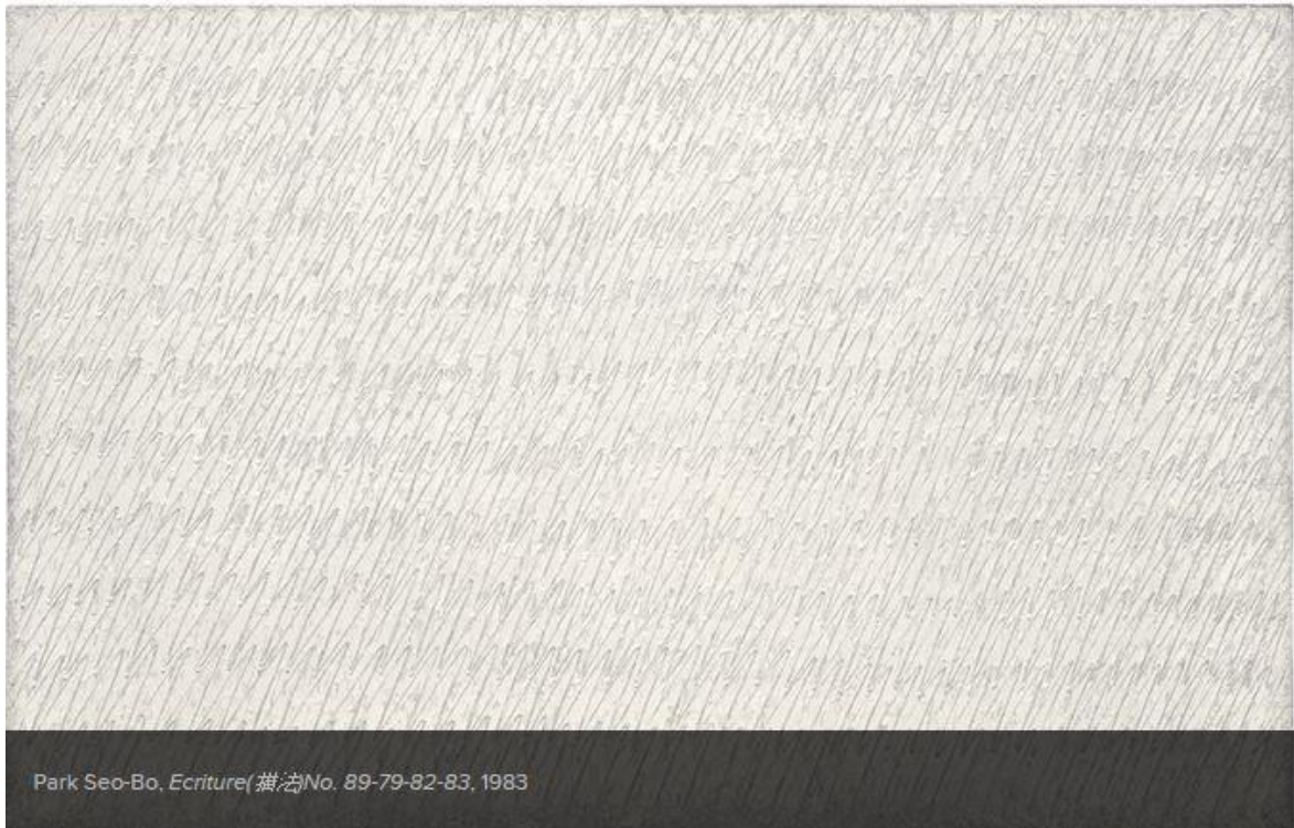
Park Seo-Bo, Ecriture (草法) No. 89-79-82-83, 1983