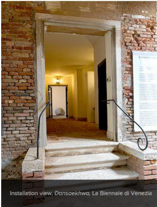
Installation view, Dansaekhwa , La Biennale di Venezia