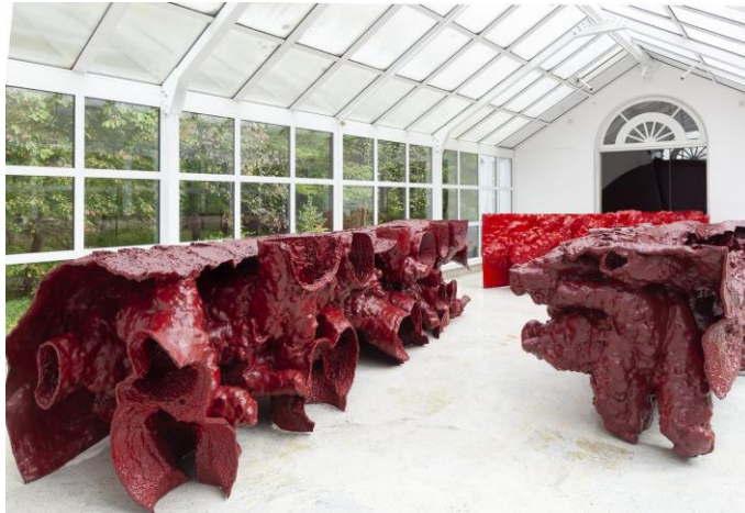
Anish Kapoor, Future, 2006, Centre of Polish Sculpture in Orońsko 1.10.2022-12.02.2023

'Men have no access to blood, and women do [...] Menstruation is the way that blood and earth connect – how do men have access to blood? War, circumcision, and hunting. Those are the only ways,' stated Kapoor himself. I am reminded of these words as I look at the sculpture which is titled 'Purple Scrape' (1996) and exhibited as though it were an innocently preserved specimen at the Orangery of the Centre of Polish Sculpture in Orońsko.