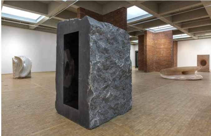
Anish Kapoor, Centre of Polish Sculpture in Orońsko 1.10.2022-12.02.2023