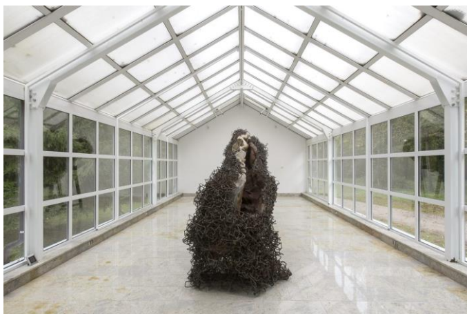
Anish Kapoor, A Blackish Fluid Excavation, 2018, Centre of Polish Sculpture in Orońsko

What do the sculptures of Kapoor mean, then? Personally, I view Kapoor's art practice in terms of sculptural poetry. His abstract forms made from a variety of materials, their sheer scale that confronts my body with 'the body of sculpture' are all elements of the syntax that, like in a poem, denote much more than just a string of letters and clever word order. They liberate the imagination, stimulate abstract thinking and allow me to confront the self in moments of tranquillity – all this invisible universe held within. Crevices, holes, fractures and transitions create a void, a potential space to be filled through an interaction with art. Intimate shapes open up the portal to intimate reflection. Some of these shapes resemble a womb – a mother's womb, a womb of nature, and taking a step further, the primordial conditions and mechanisms of our existence.