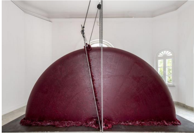
Anish Kapoor, Gretshemane, 2013, Centre of Polish Sculpture in Orońsko 1.10.2022-12.02.2023, © Anish Kapoor. All rights reserved DAGS, 2022

In October 2022, I participated in the conference alongside Anish Kapoor that accompanied his solo show in Orońsko, which is open until the 12th of February 2023. During a discussion, the artist frequently mentioned his relation to nature and organic forms, as well as his approach to materials and hues, which reverberate throughout his practice. It is also worth pointing out that it is only the second largest exhibition of his stone sculptures, following his show in Istanbul.