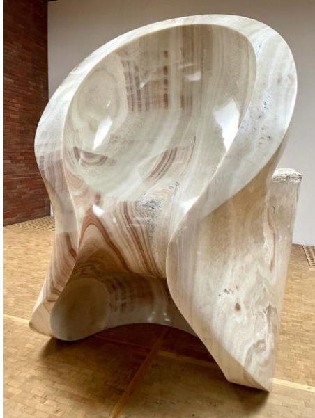
Anish Kapoor, Centre of Polish Sculpture in Orońsko 1.10.2022-12.02.2023