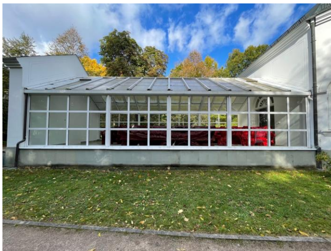
Anish Kapoor, Centre of Polish Sculpture in Orońsko 1.10.2022-12.02.2023