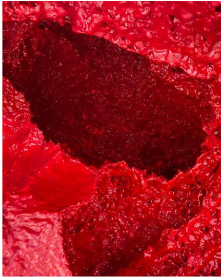
Anish Kapoor, Centre of Polish Sculpture in Orońsko 1.10.2022-12.02.2023