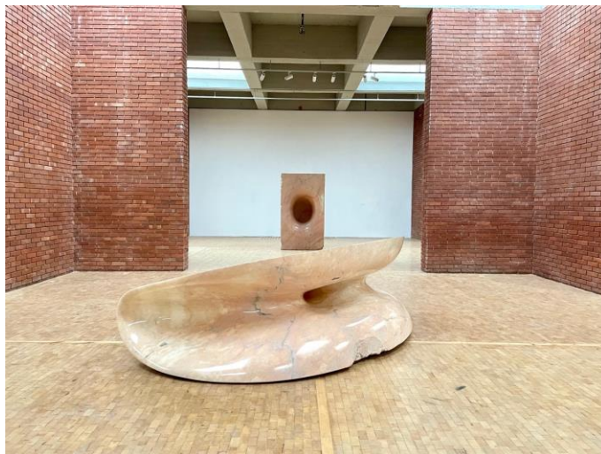
Anish Kapoor, Centre of Polish Sculpture in Orońsko 1.10.2022-12.02.2023