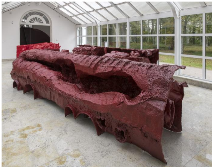
Anish Kapoor, Future, 2006, Centre of Polish Sculpture in Orońsko 1.10.2022-12.02.2023

A monumental sculpture, meaty, blood-red and porous; reminiscent of an artery that has just been extracted from an organism, through which had pumped blood only minutes ago, this life-giving substance is placed inside a glazed interior – like a jar with formaldehyde or an aquarium built from the museum walls. Sunlight floods in through the glass windows from all angles, falling on the irregular, fracturing resin surface of a sculpture, illuminating its texture, crevices and the saturation of the wax's hue.