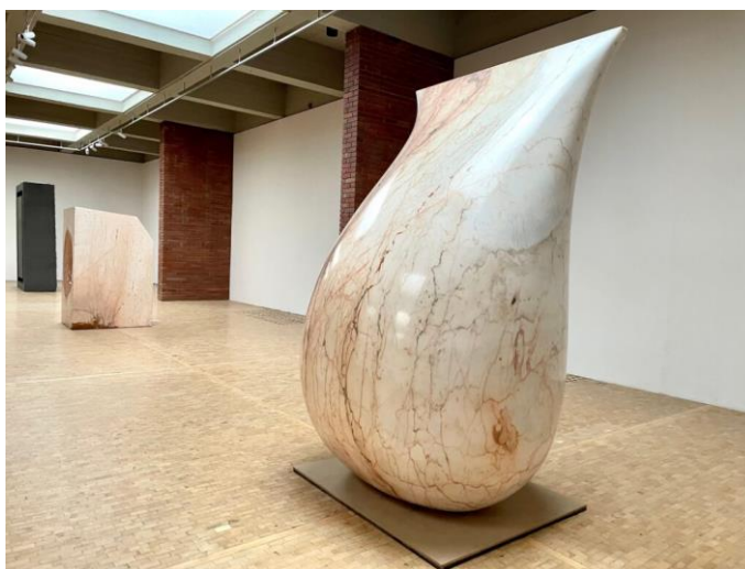
Anish Kapoor, Centre of Polish Sculpture in Orońsko 1.10.2022-12.02.2023