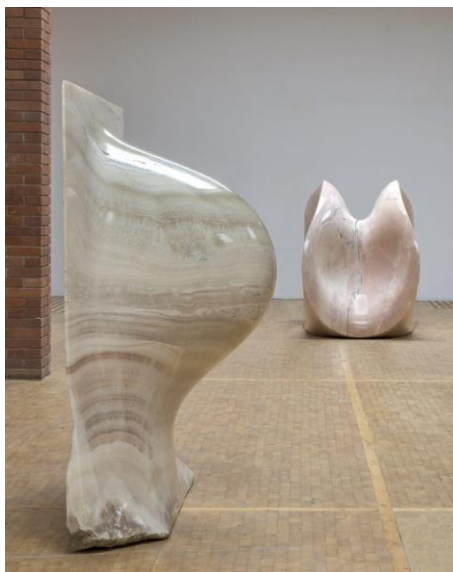
Anish Kapoor, Centre of Polish Sculpture in Orońsko 1.10.2022-12.02.2023